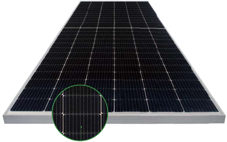
MBB HC Technology

Occupational health and safety management systems